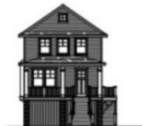
1 FRONT ELEVATION SCALE 1/8" = 1'-0"

Photos represent 1 example of a perspective plan.