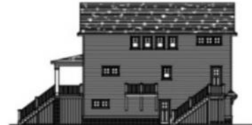
2 RIGHT SIDE ELEVATION SCALE 1/8" = 1'-0"