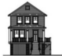
1 FRONT ELEVATION SCALE 1/8" = 1'-0"

Photos represent 1 example of a perspective plan.