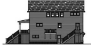
2 RIGHT SIDE ELEVATION SCALE 1/8" = 1'-0"