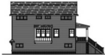
3 LEFT SIDE ELEVATION SCALE 1/8" = 1'-0"