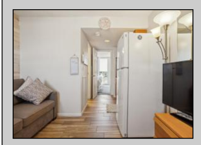
225 Wildwood Wildwood, NJ 08260