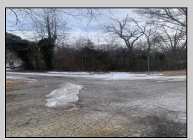
20 10Th Rio Grande, NJ 08242