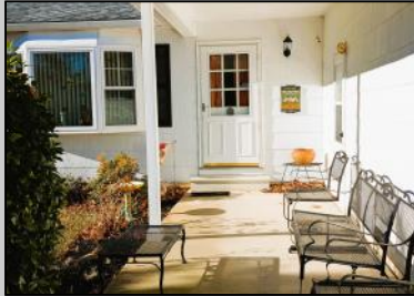
2707 Weaver Villas, NJ 08251