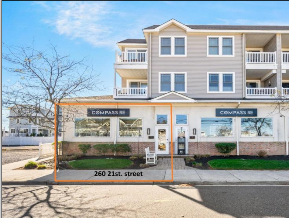
260 21st. street