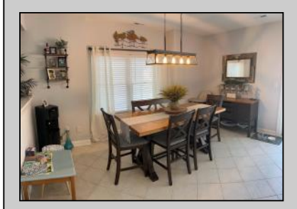
105 Primrose Wildwood Crest, NJ 08260