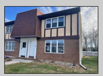
1964 Oak Vineland, NJ 08360