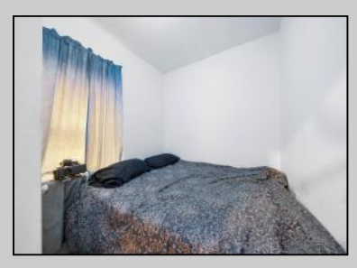
1206 Bayshore Villas, NJ 08251