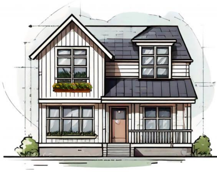
AI generated not actual plans