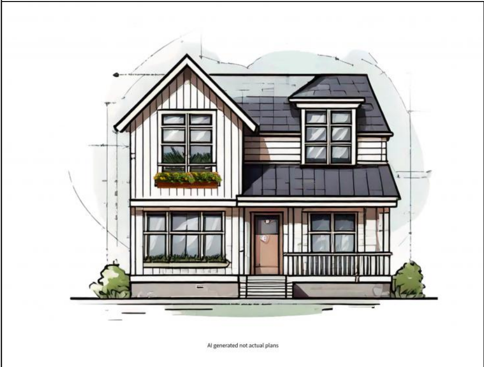
AI generated not actual plans