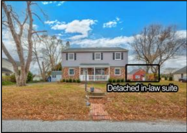
Detached in-law suite