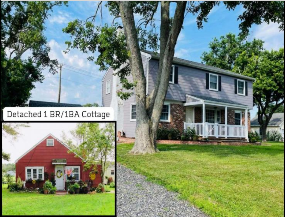
Detached 1 BR/1BA Cottage