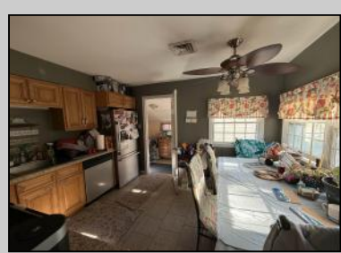
66 Beachhurst North Cape May, NJ 08204