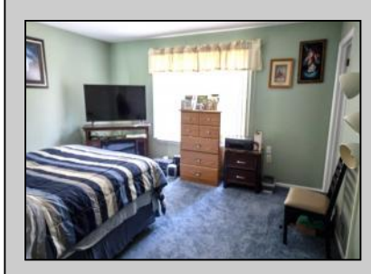
143 Valley Forge Little Egg Harbor, NJ 08087