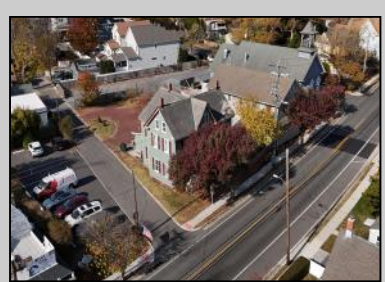
414-416 Broadway West Cape May, NJ 08204