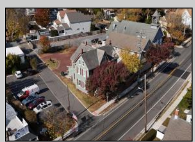
414-416 Broadway West Cape May, NJ 08204