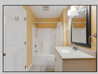
320 Bennett Wildwood, NJ 08260