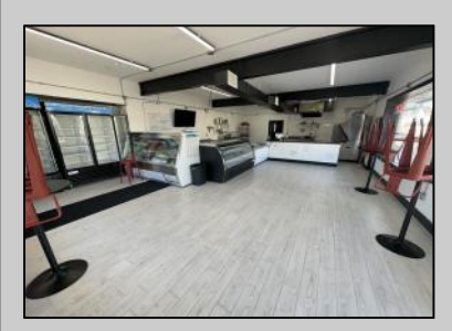
5400 Pacific Wildwood Crest, NJ 08260