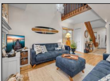
301 South Station Lower Township, NJ 08260