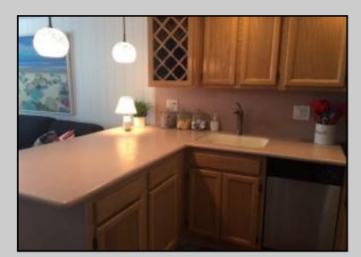
3010 Ocean Wildwood, NJ 08260