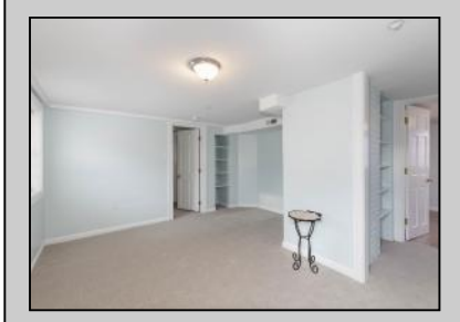
215 24th North Wildwood, NJ 08260