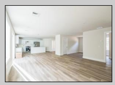
76 Rising Sun Ocean View, NJ 08230