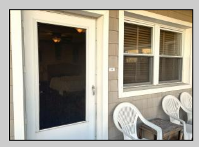
9010 Atlantic Margate, NJ 08402