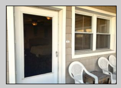
9010 Atlantic Margate, NJ 08402