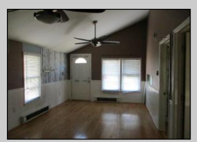
107 Indian Trail Burleigh, NJ 08210