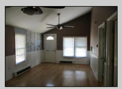
107 Indian Trail Burleigh, NJ 08210