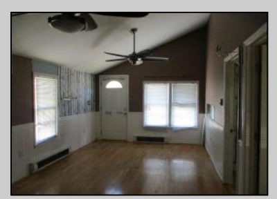
107 Indian Trail Burleigh, NJ 08210