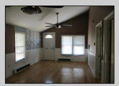
107 Indian Trail Burleigh, NJ 08210