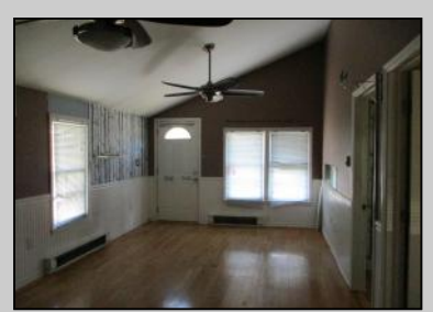
107 Indian Trail Burleigh, NJ 08210