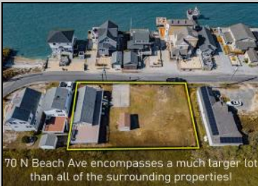
70 N Beach Ave encompasses a much larger lot than all of the surrounding properties!