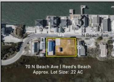
70 N Beach Ave | Reed's Beach Approx. Lot Size: .22 AC