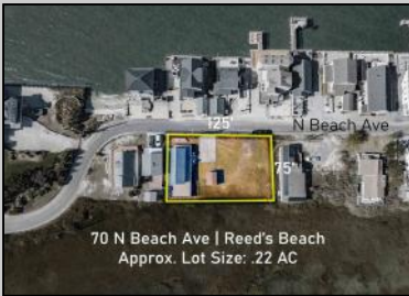
70 N Beach Ave | Reed's Beach Approx. Lot Size: .22 AC