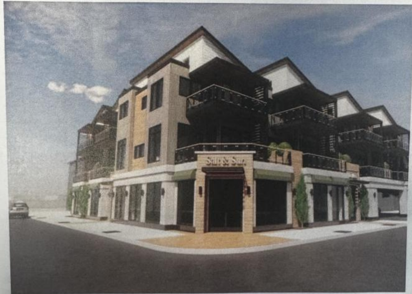
3 PERSPECTIVE - LANDIS AVENUE 6" = 1'-0"