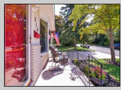
316 Jefferson Linwood, NJ 08221