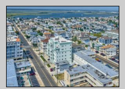
407 Monterey Wildwood Crest, NJ 08260