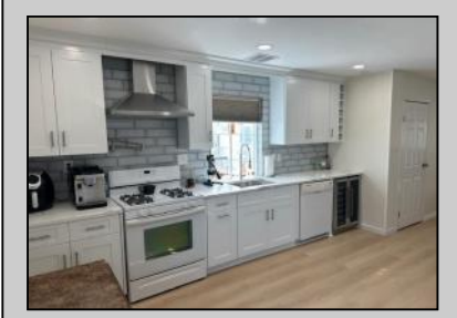
420 Berkshire Ventnor, NJ 08406