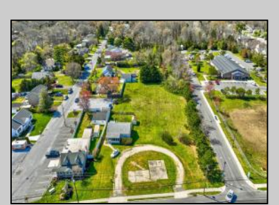
621 Route 9 S Cape May Court House, NJ 08210