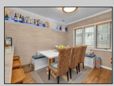
301 South Station Lower Township, NJ 08260