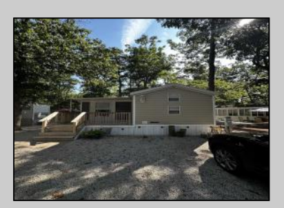
3066 Rt. 9 S. Seaville, NJ 08230