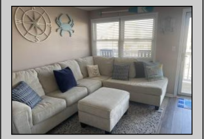
1100 New Jersey North Wildwood, NJ 08260