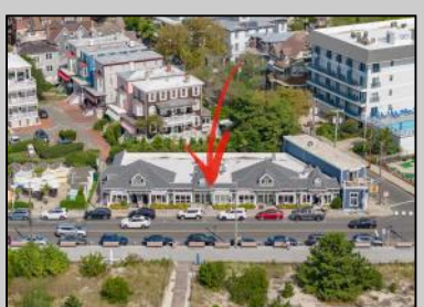
314 Beach Cape May, NJ 08204