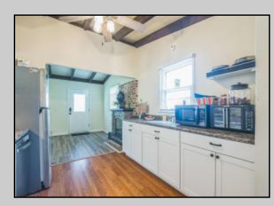
53 Beachhurst North Cape May, NJ 08204