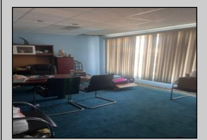
3204 Pacific Wildwood, NJ 08260