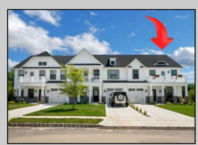
501 Southgate Cape May Court House, NJ 08210