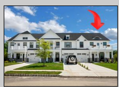
501 Southgate Cape May Court House, NJ 08210