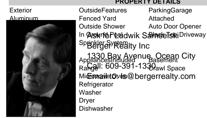
Cooling Central Air Condition Multi Zoned