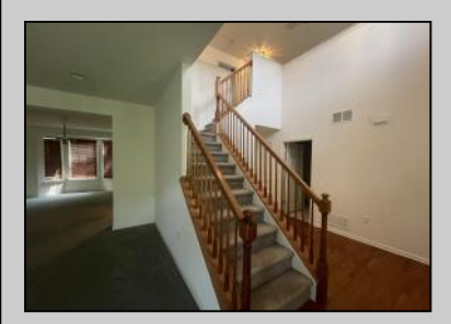
137 Kensington Galloway Township, NJ 08205