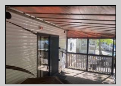
491 US route 9 Erma, NJ 08204