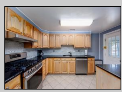
110 Bucknell Del Haven, NJ 08251