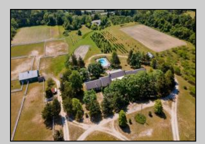
3065 Route 9 So. Seaville, NJ 08230